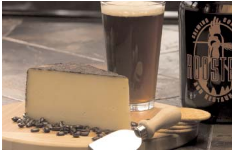
Beehive Cheese Company's award-winning Barely Buzzed Cheddar is hand-rubbed with a mixture of Turkish coffee grounds and French lavender, pressed into the cheese with canola oil. The cheese is then aged on Utah Blue Spruce aging racks in the company's humidity-controlled caves.

During the design phase of the plant, Welsh travelled across the country visiting small cheese makers, gathering information and inquiring about the "biggest mistakes" made before eventually achieving success.